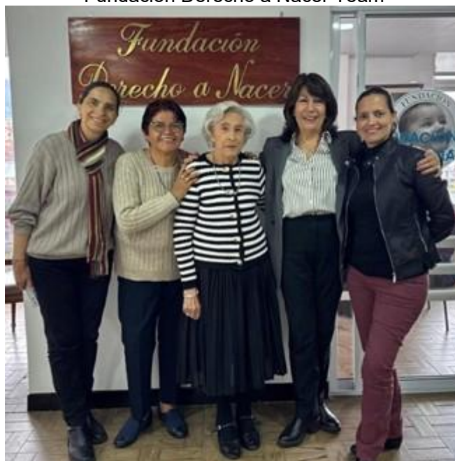
Fundacion Derecho a Nacer Team

[1] Proyecto Esperanza is an organization that helps women and men who are in pain from voluntarily terminating a pregnancy. Helping them work through their pain, Proyecto Esperanza strives to be a light of hope in their paths, helping them face the pain and giving them a new meaning to life.