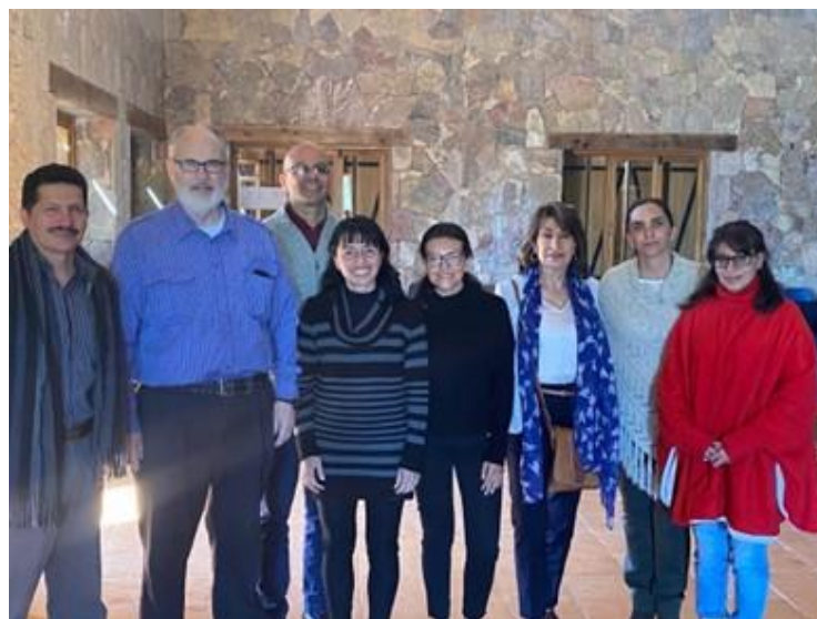
Fundacion Derecho a Nacer Team